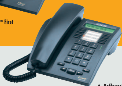
▲ Reflexes™ Easy